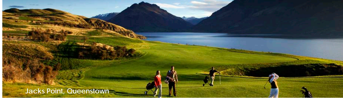
Jacks Point, Queenstown